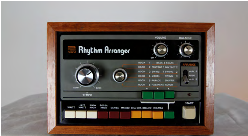
Figure 6: The Roland TR-66 Rhythm Arranger might be regarded as the last, pure preset drum machine produced by the renowned manufacturer Roland. It came in a handy shoebox size. The presets included possible combinations and the arrangement feature can clearly be seen in the figure. All subsequent models provided expanded options for programming and arrangement, until the drum machines of the 1980s brought about true liberation in groove creation via a programmable matrix.

As we have seen, the construction and design of 1970s drum machines offered little to no possibility for individual programming. Instead, musicians had to work with existing patterns, with the particular machine being used dictating the range of options available. As a case study, we can use the Roland TR-66, which includes the most common patterns. The manual offers a transcription of the accessible presets: