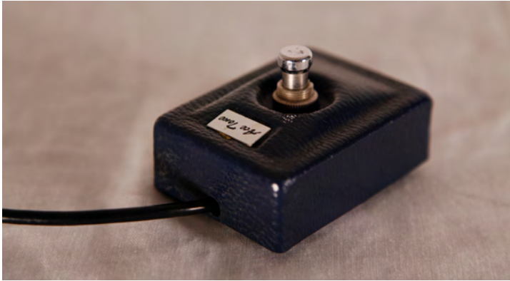
Figure 5: The original footswitch from the company Ace Tone/Roland was used to start and stop the rhythms of the drum machine, thereby keeping the musician's hands free to play the instrument. Nearly all devices from the 1960s and 1970s came with a pre-installed matching jack input. Photo: Robert Michler, 2022