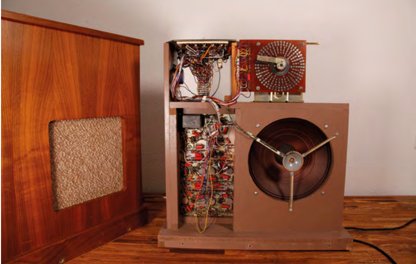
Figure 2: The electro-mechanical construction with hand-wired connections, a constantly rotating disc to set a steady tempo, and a connected comb to pick up signals at the contact points created the different grooves. This principle was unique and very different to subsequent drum machines. Thus, its key features were seminal with regard to the preset patterns included.