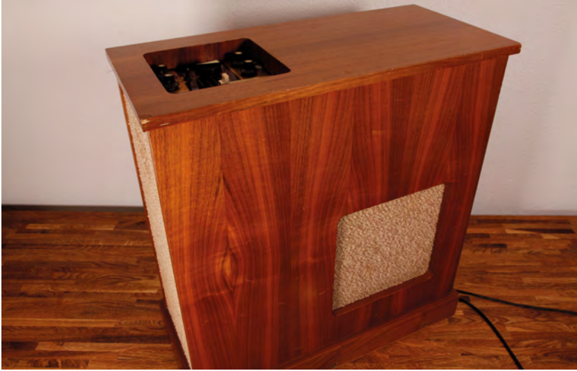
Figure 1: The Wurlitzer Sideman came in a heavy wooden box. It included an integrated amplifier and internal tubes, resulting in a total weight of approximately 40 kg.