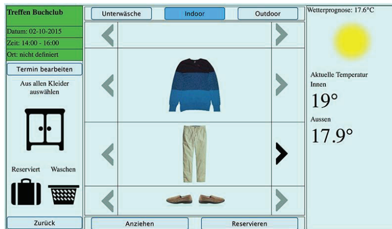
Figure 2. Display with the clothing suggestion and the current weather condition.

At the heart of the work is the wardrobe in the bedroom. The tablet PC on the front door displays a summary of the appointments for the day, the inside temperature, the current weather conditions and the forecast. If a calendar entry is tapped, an appropriate clothing proposal is generated using the following data (figure 2): The current temperature in the apartment, the actual outside temperature, the weather forecast and the nature and duration of the event. The user receives a suggestion for clothes that are suitable for the chosen occasion and conditions. For appointments outside the apartment, the outerwear is calculated accordingly. If the user doesn't like the proposal, he/she can browse through more clothing suggestions. The system remembers in a learning algorithm whether certain garments are chosen more often and recommends their use more frequently.