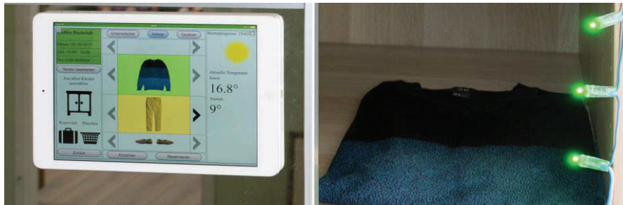
Figure 3. On the display the sweater is marked in green as well in the wardrobe.