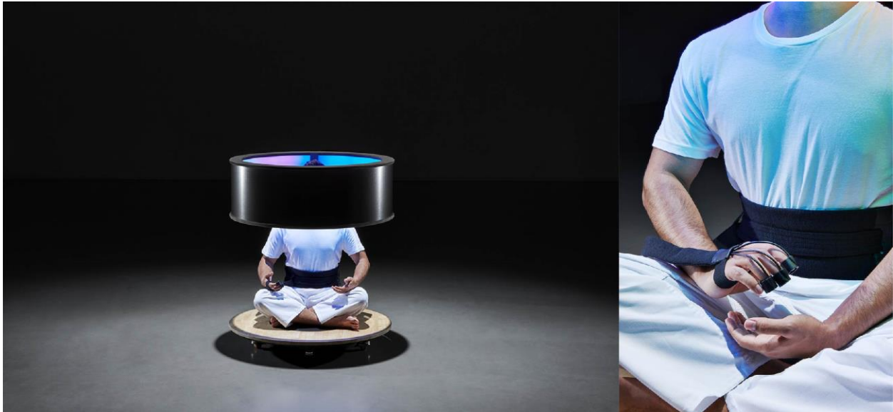
Figure 4. The meditation deck with light ring, bespoke breathing belt and finger sensors

The round meditation deck has a low wooden platform and cushion for practitioners to sit on in a traditional cross-legged position. The upper light ring opens to allow practitioners to enter and leave. We designed a new breathing belt made of natural banana fiber by integrating a pressure sensor into a traditional Taoist garment. Practitioners also wear three rings and a fabric band which conceal skin conductance and heart rate sensors. These minimal and non-invasive sensors are connected to computers which control the individual and collective feedback.