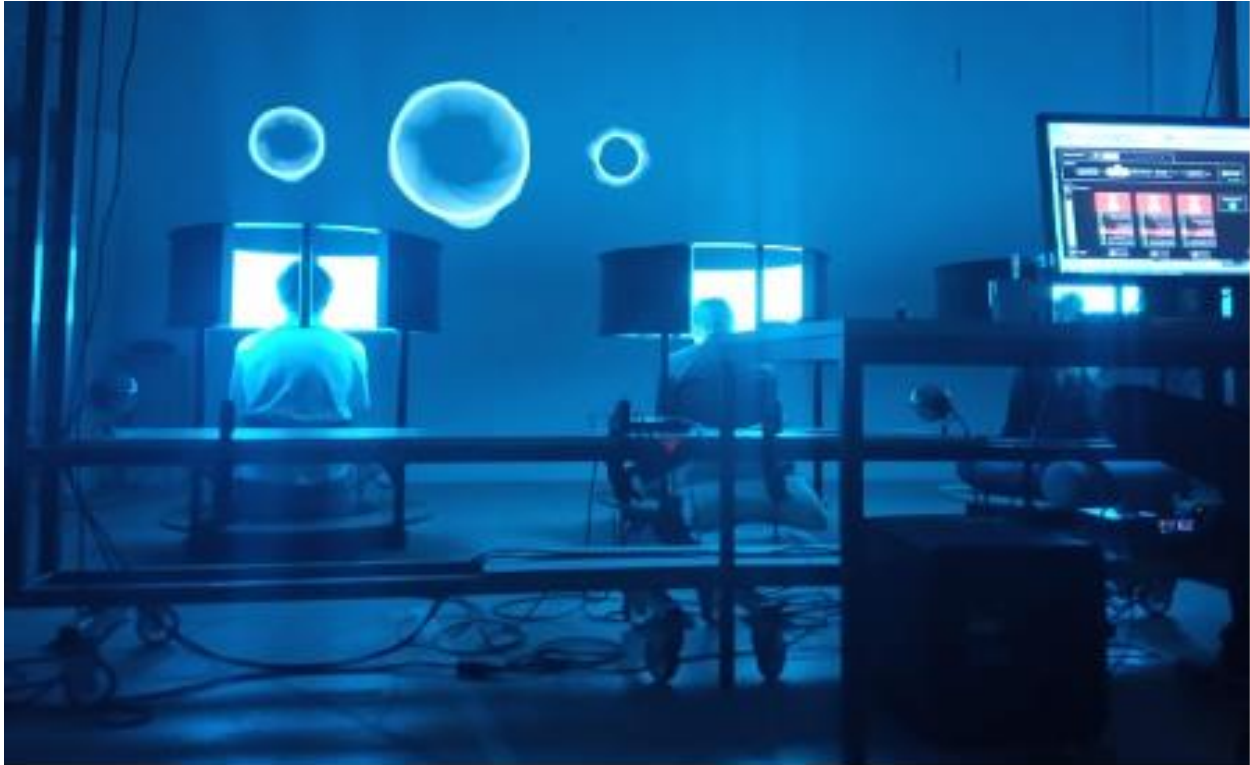
Figure 6. Evaluations in our laboratory

17 participants (aged 20 – 55, 59% female) completed the study. Recruitment didn't specify cultural meditation background. Participants didn't know each other and groups of three were assigned randomly. Eight participants stated that they used tools such as guided meditation or applications and four reported using meditation visualization techniques, with no significant correlation to age or frequency of practice.