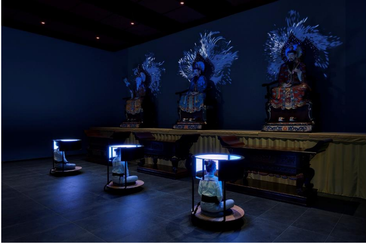
Figure 1. The meditation decks at Ming Shan Temple