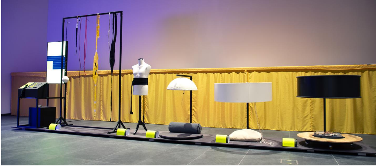
Figure 3. Development of the deck and sensors