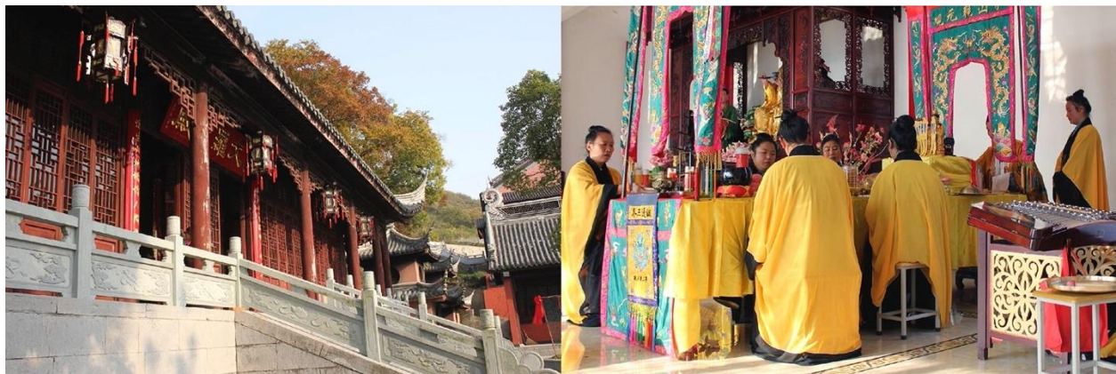
Figure 2. Field observations in China