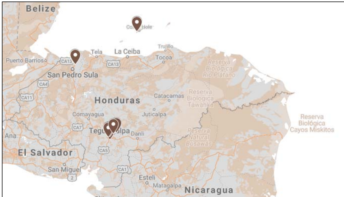
Figure 3. Location of the Research