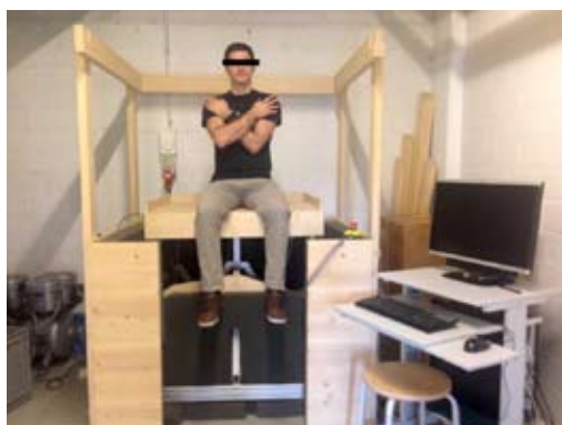
Figure 2 Sitting position on the vibration platform. HRV: Heart rate variability; EMG: Electromyography.

session. HRV was measured with Polar V800 and heart rate sensor Polar H7 (©Polar Electro 2016). Giles, Draper [28] showed that R-R intervals and HRV do not differ between recordings from Polar V800 and electrocardiography (ECG).