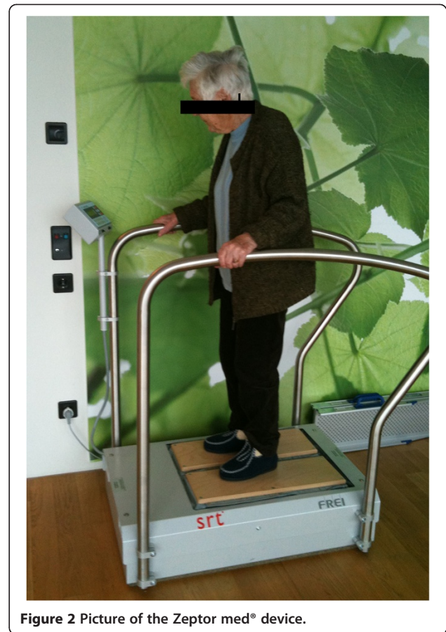
Figure 2 Picture of the Zeptor med ® device.

The criteria for success [19] of this pilot study were based on feasibility and focused on recruitment, attrition and adherence to the stochastic resonance WBV intervention.