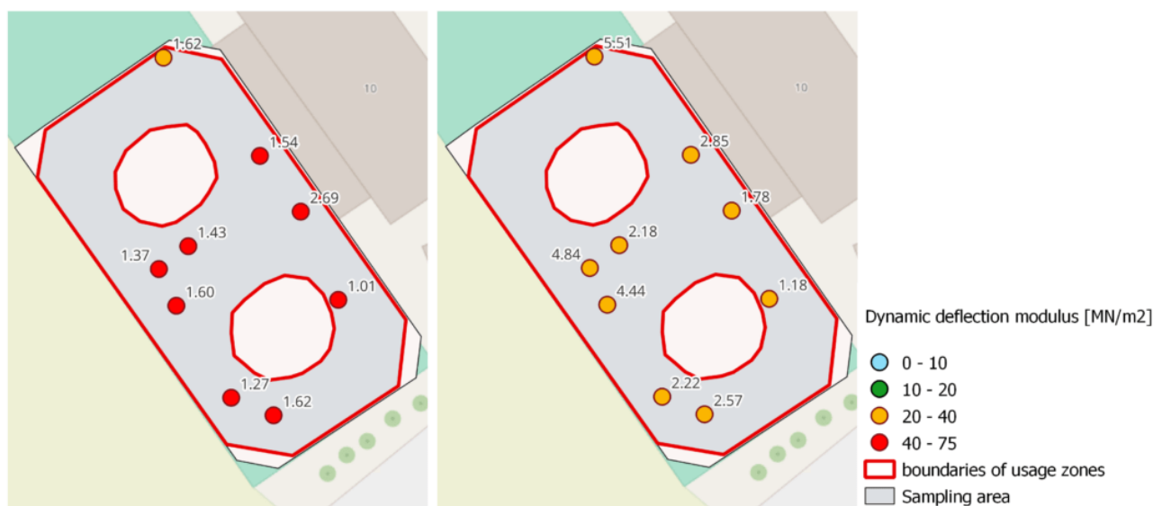
Fig. 1: Spatial variations in the sports physiological characteristics of the equestrian arena site 2 between week 4 (left) and week 7 (right). Red lines indicate the arena's usage zones. Grey area: sampling area within which random samples were taken.

including the rebound velocity of the LWD drop plate, could serve as an objective method to describe the reactivity of an equestrian arena surface.