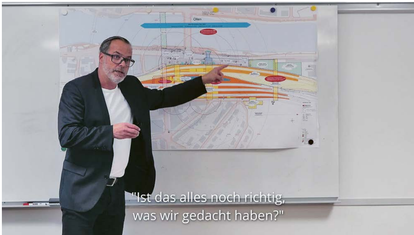
FIGURE 2: Triggering transdisciplinary learning processes: using the development zone plan to develop future mobility hubs. Subtitle: “Is everything we thought earlier right?” (Video still, with permission by M. Neuenschwander, depicted. Bahnhof Olten: Kooperation in Beton gegossen , 2020, 10:54).

producing an SLV, thereby co-producing knowledge with all their practice partners (table 1).