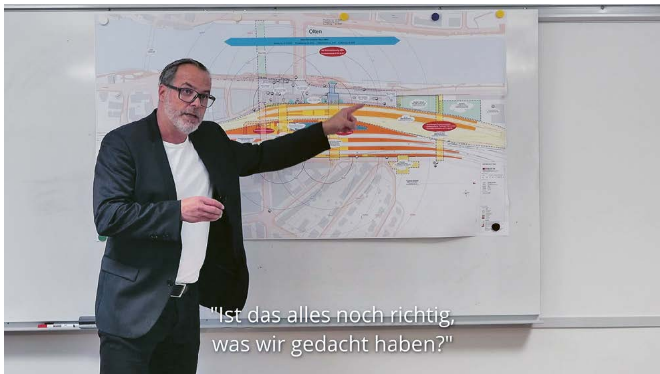
FIGURE 2: Triggering transdisciplinary learning processes: using the development zone plan to develop future mobility hubs. Subtitle: "Is everything we thought earlier right?" (Video still, with permission by M. Neuenschwander, depicted. Bahnhof Olten: Kooperation in Beton gegossen , 2020, 10:54).

producing an SLV, thereby co-producing knowledge with all their practice partners (table 1).