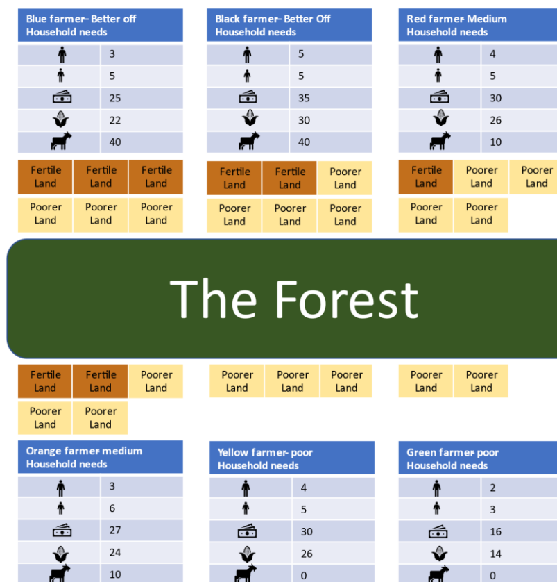
Figure 2. The game board layout.  The forest (centre) is surrounded by six farming households. Each household has a certain set of farmland conditions (fertile and less fertile patches of land). Household represents three levels of “wealth”, with different amounts of physical, social, and natural assets [72] detailed on their “game cards”.

game, all of the farmers and facilitators reviewed the decisions made during the game and discussed the reasoning behind them. This group debriefing was significant in highlighting the different decisions taken by each of the teams. The players also found it very interesting to hear how other teams had approached their decisions and to hear about the results of these disparate approaches.