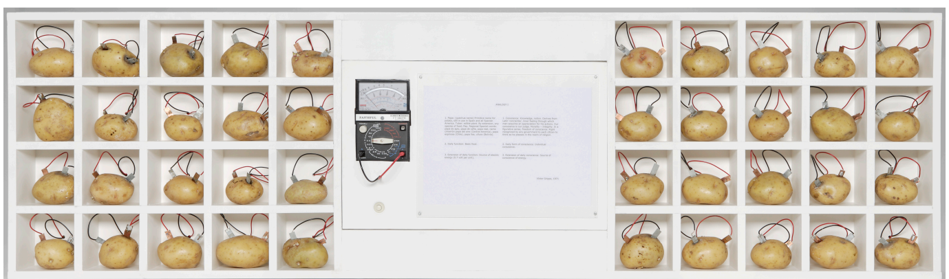
Figure 2. Victor Grippo, Analogía I , 1970–1971, electric circuits, electric meter and switch, potatoes, ink, paper, paint, and wood. Dimensions: 47 × 156.2 × 10.3 cm (18 ½ × 61 ½ × 4 1/16 in.). Harvard Art Museum (2010)/Fogg Museum, Richard Norton Memorial Fund and gift of Leslie Cheek, Jr., © The Estate of Victor Grippo, Photo © President and Fellows of Harvard College, 2010.3.

This artwork is part of the Analogía series (1970–1977) in which Grippo used potatoes in multiple variations (Longoni 2004, pp. 21–23, 78–83, 86, 92–93). The series includes, for example, Analogía I (1970–1971): here, one potato is placed in each compartment of a wooden shelf; in total, there are forty potatoes connected to each other and to a tension gauge in the center (Figure 2).