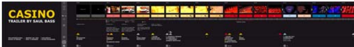
Figure 3: Analysis of a trailer for the film Casino by Martin Scorsese with a pattern based visualization, student's work by Juan Arroyo and Oliver Hochscheid