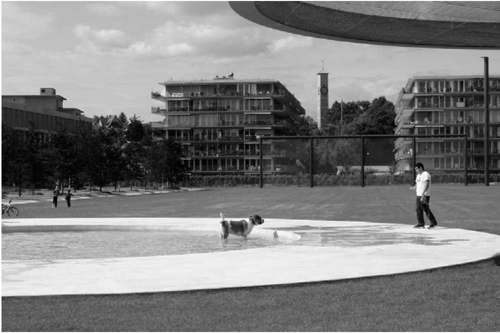
Fig. 3: Water basin at Wahlenpark with ball catch fence and flood light post in the background Das Wasserbecken im Wahlenpark, im Hintergrund das Ballfanggitter und der Flutlichtmast Le bassin du Wahlenpark avec en arrière-plan la barrière et le projecteur Photo: by courtesy of F. SCHMIT, summer 2005

In the following section, attention is given to the ways people sojourning at Wahlenpark deal with these opportunities – what kinds of spaces do park users produce?