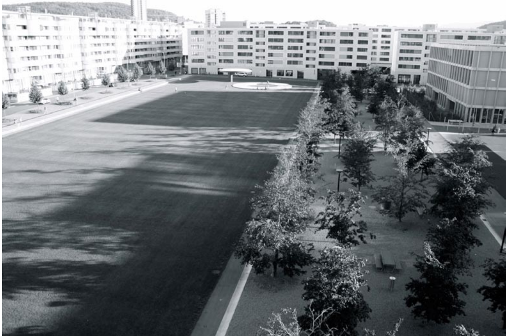
Fig. 2: Bird's eye view of Wahlenpark in Zurich (Switzerland) with the bosk on the right, the lawn in the centre, the concrete element on the left and the water basin in the background

Der Wahlenpark in Zürich (Schweiz) aus der Vogelperspektive. Auf der rechten Seite ist der Buchenhain zu sehen, in der Mitte die Spielwiese, links der Sitzbalken und im Hintergrund das Wasserbecken.