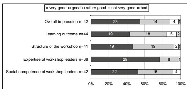
Figure 2: Students' rating of several aspects of the workshop on a 5-point scale. Social competence of workshop leaders referred to whether participants perceived workshop leaders as helpful and whether they responded positively to the participants.

As various avenues to promote physical activity are being tested by the international research community, general practitioner referral systems have been generating promising results (Elley et al, 2003; Green et al, 2002). As measures are being taken in Switzerland to set up such a referral system, a cost-effective solution to train a sufficient number of counsellors was sought. Therefore, a training programme which was primarily based on e-learning while still integrating a workshop component was developed. It was aimed at professionals with background knowledge in health or physical activity such as physiotherapists, physical educators, nutrition-